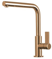
VERONA COPPER R497 D06